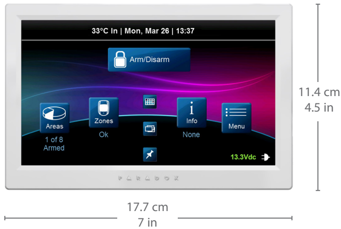
TM70: Intuitive Touchscreen